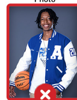
Too Far Away And Other Objects In View